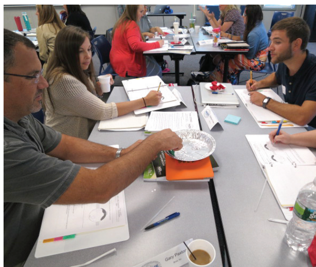
Figure 2. Teachers participating in the hands-on activity regarding convergence zones before looking at wave data from around the Palmer Research Station in Antarctica.

Through the fourth lesson we transitioned the students from spectators of the science to contributing participants in the science. The students had to make sense of data similar to what the scientists would be looking at in the field and work in teams to determine which scientific instruments they would use, and propose how they would deploy the